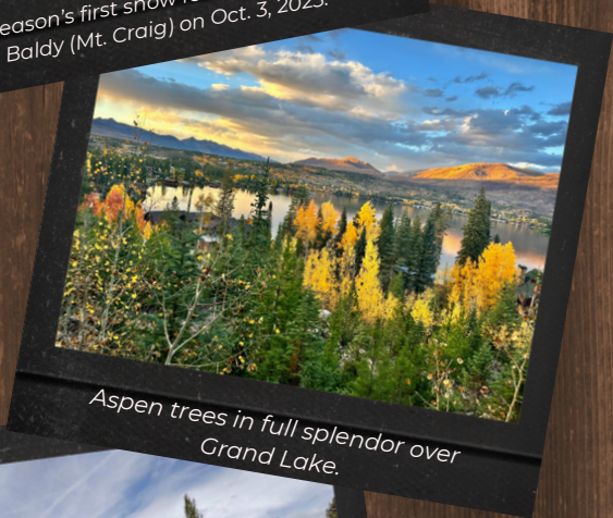
Aspen trees in full splendor over Grand Lake.