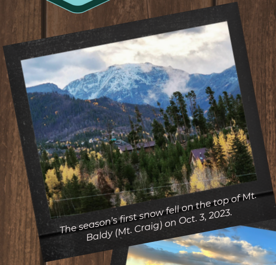
The season's first snow fell on the top of Mt. Baldy (Mt. Craig) on Oct. 3, 2023.