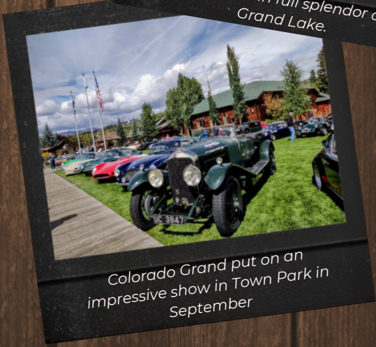
Colorado Grand put on an impressive show in Town Park in September